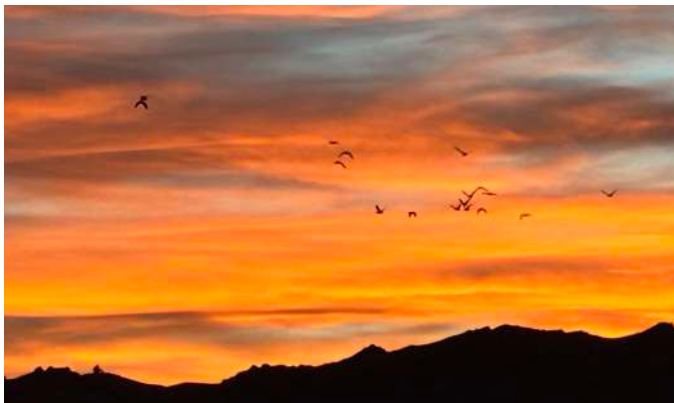
Ducks over Rough Ridge the night before opening.

For many locals, the opening weekend is about more than just the hunt itself. It is also a chance to reconnect, spend time outdoors, and continue a tradition that has been part of rural life in the Mānīatoto for generations.